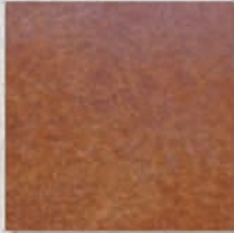
CS-700 Mission Brown